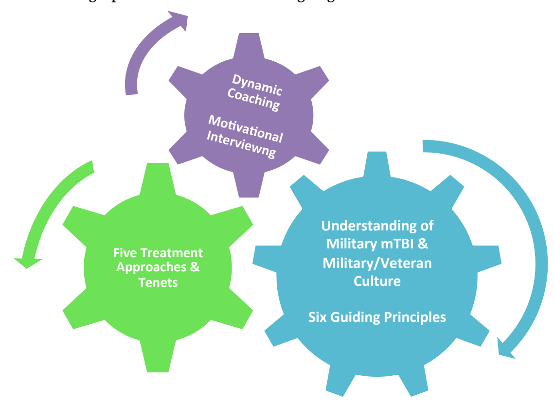
Figure 1. "Gearing Up": Mechanism for Providing Cognitive Rehabilitation to SM/Vs

Preparedness for engaging with SM/Vs in the therapeutic process includes understanding of the military mTBI population, common comorbidities, expected course of recovery, military/veteran cultural competence, and knowledge and skills in treatment approaches to cognitive rehabilitation. The clinician and SM/V work collaboratively to identify which of the five treatment approaches described in the next section will facilitate goal attainment based on personal preferences and the nature of the goal selected for intervention. The six GPs, MI techniques, and dynamic coaching will facilitate patient engagement and self-monitoring for the durability of gains achieved in treatment. The following diagram illustrates the synergistic relationship of these therapy tools.